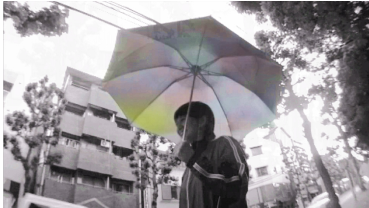
Figure 2: The Colourful Rain umbrella , an indirect kansei design

The Colourful Rain project (Lévy, Kim, Tsai, Lee, & Yamanaka, 2009) is the kansei design of an umbrella letting the user experience a synaesthetic perceptive phenomenon: all the sounds of the environment in which the umbrella is being used are also perceived as colors (visually) on the umbrella canopy (cf. Fig.2). To do so, the synaesthetic phenomenon was detailed from a psychophysiological point of view, which was used both as an inspirational starting point for the design activity (Lévy et al., 2011) and as a means to determine the design requirements for a consistent synaesthetic experience.